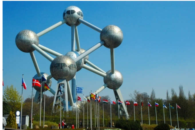
The Atomium stands in Brussels, Belgium as a reminder of the World Fair that was held in 1958.