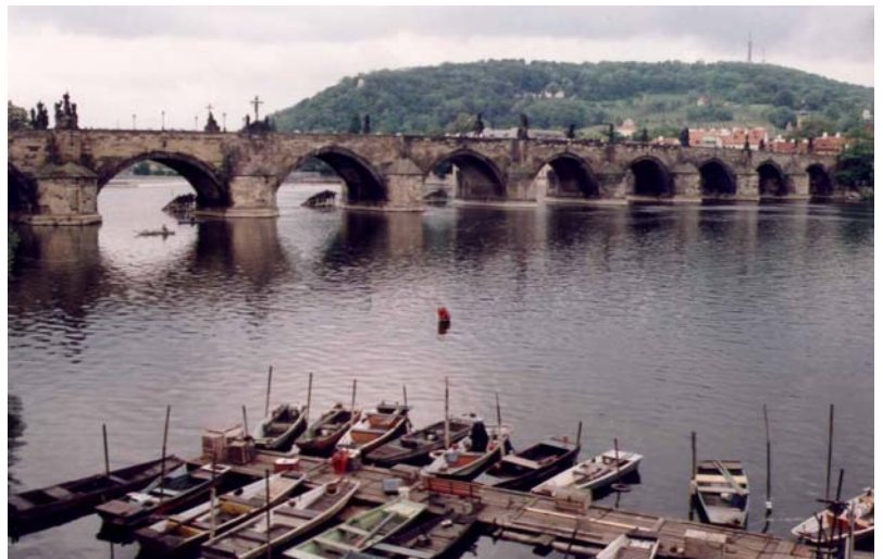
The Charles Bridge, a host to 30 statues, was completed in the 15 th century.