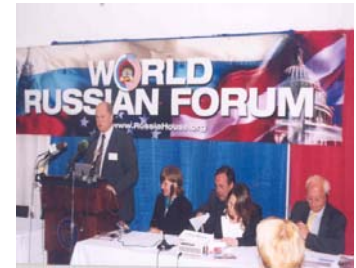
WORLD RUSSIAN- AMERICAN FORUM 2007 May, 2007

The Eurasia Center reaches the world. Monthly newsletters, Invitations to the "Evening with the Embassies" events, and information distributed to 55,000 leaders throughout America and Eurasia. We are the only non-profit organization focused upon Eurasia which can guarantee the 38 Embassies and countries world-wide television coverage. Our highly respected INTERNATIONAL INVESTOR televised broadcasts reach 55 American cities and satellite broadcasts internationally to 132 countries.